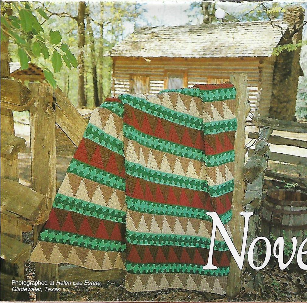
Photographed at Helen Lee Estate, Gladewater, Texas