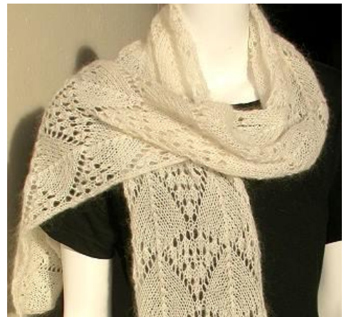
The scarf is super soft and drapey.