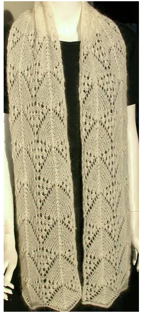
A luscious scarf with only two balls.