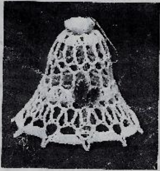
HOSE-TOP BELL SC0624 $16.95

This is a small, white, crocheted bell-shaped sculpture. It is made of a light-colored, intricate lace-like material with a pattern of small, repeating motifs. It has a small, rounded top and a flared, bell-like shape. The background is dark, making the white sculpture stand out.